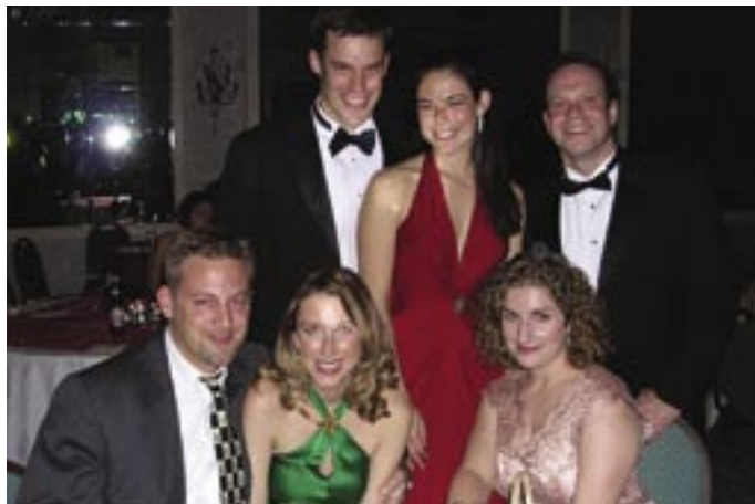
Northwestern alumni and friends together at the Hotel Washington during our annual holiday gala

www.alumni.northwestern.edu/washington_dc