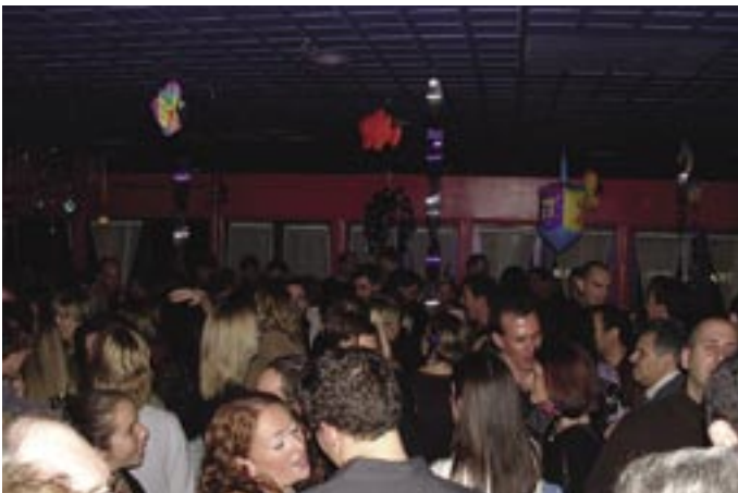
Hundreds of Singles mix and mingle and the Jewish Sports and Social Network's annual Chanukah Bash, which collects toys for local families in need.

The Jewish Sports and Social Network is Washington/Baltimore's biggest group for Jewish young professionals, young couples, and singles of all ages. With over 12,000 members, JSSN offers over 60 different programs monthly including happy hours, hikes, bike rides, tennis socials, volleyball, rock climbing, bowling, billiards, embassy and museum events, gallery receptions, film nights, pool parties (indoor, outdoor, and rooftop), dances, game nights, club parties, JDate events, Speed-Dating, Progressive Dinners, Shabbat dinners, potlucks, sailing, cruises, day trips, community service projects, networking, coffee houses, sing-alongs, wine tasting, lectures, mixers, book discussion groups, Judaic learning, and more. Events take place in Arlington, Bethesda, Columbia, DC, Baltimore and throughout the Metro Area.