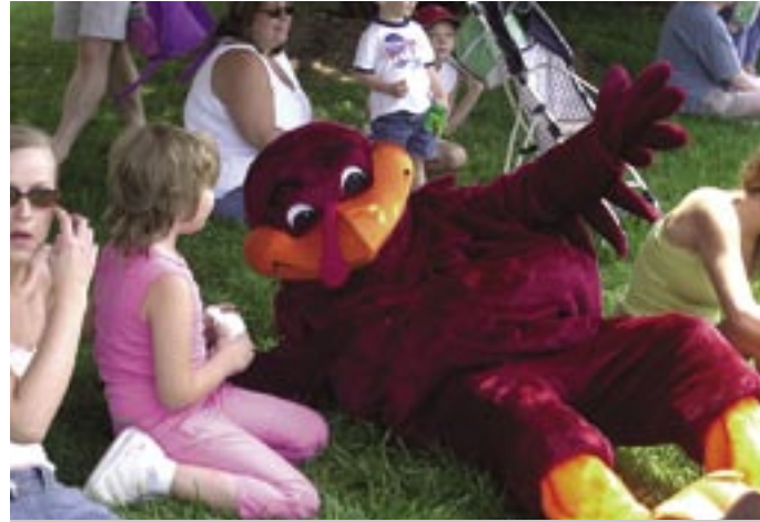
The Hokie Bird makes new friends at the Fairfax Fair.

The National Capital Region (NCR) Chapter of the Virginia Tech Alumni Association is comprised of over 25,000 Virginia Tech alumni living in the Washington, DC area. This chapter includes the cities of Alexandria, Falls Church, and Fairfax, as well as Arlington and Fairfax counties in Virginia; the District of Columbia; and Prince George's and Montgomery counties in Maryland.