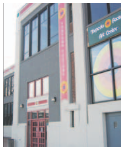
THE ALEXANDRIA WATERFRONT (TOP) IS A POPULAR SPOT FOR RELAXING. UNION STREET PUBLIC HOUSE (CENTER) IS THE PLACE TO GRAB A MICRO BREW. THE TORPEDO FACTORY (BOTTOM) IS HOME TO A RANGE OF ART GALLERIES AND SHOPS.