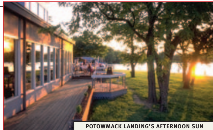
POTOWMACK LANDING'S AFTERNOON SUN

Plucked from the southland and planted in Old Town, Alexandria, Southside 815 serves up more than southern hospitality. Featuring