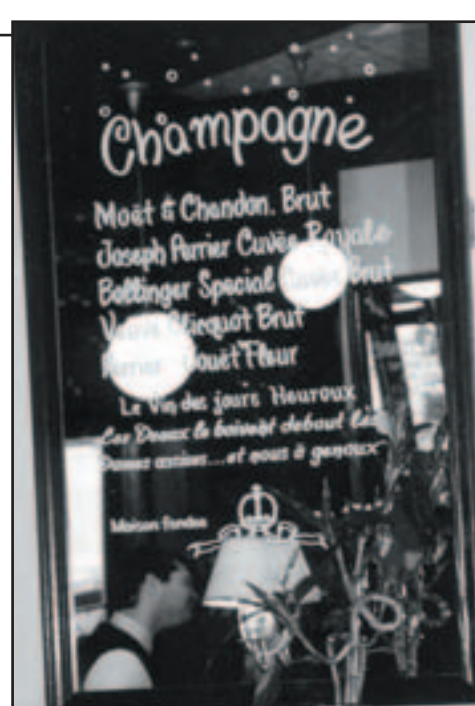
CHAMPAGNE IS BIG AT MON AMI GABI

Before or after leisurely browsing Eastern