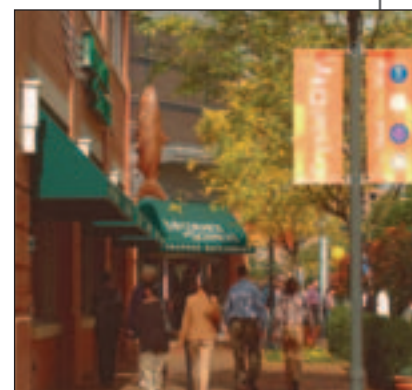
TOP TO BOTTOM: PENTAGON ROW, CHAMPPS' PATIO AT PENTAGON ROW, MARGARITA AT OYAMEL IN CRYSTAL CITY, FASHION CENTRE AT PENTAGON CITY, RESTAURANTS OF CRYSTAL DRIVE.