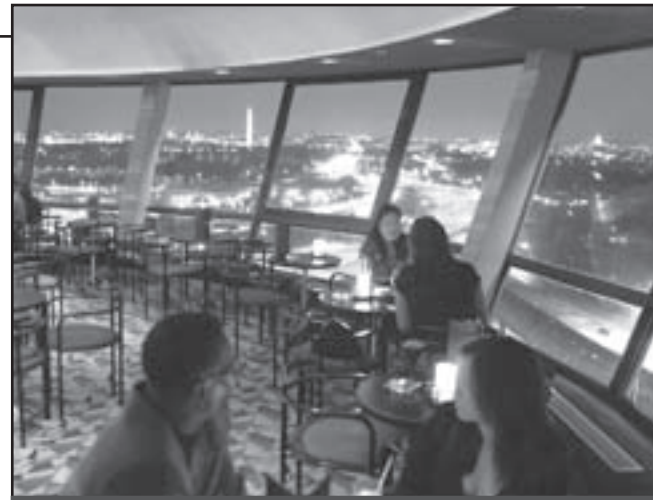
FOR SPECTACULAR VIEWS OF THE CITY WITH YOUR MEAL, IT'S HARD TO BEAT THE SKYDOME LOUNGE.

better when it's beautiful. If the spinning makes you ill, opt for Windows on Washington , DoubleTree's non-rotating, but equally elegant dining option. When pub-crawling, you can't miss James Mackey's Public House (320 S. 23 rd St., 703-412-1113), sister restaurant to the Mackey's in the District. The second coming of Bailey's Pub and Grille (2010-A Crystal Dr., 703-416-0452) has arrived in Crystal City. Smaller and sleeker than the original pub, this Bailey's offers more of a pub atmosphere than its giant predecessor, located in Ballston Mall. Near Bailey's are two new tapas restaurants; The first, Jaleo (2250-A Crystal Dr., 703-413-8181), has crossed the bridge into the Commonwealth, finally. This, considered the restaurant that made José Andrés famous in the city, was one of the first staples of the new Crystal City redevelopment. Crystal Drive is now a two-way street, and is literally blossoming with new restaurants, shops and cafes. Oyamel (2250 Crystal Dr., 703-413-2288), serving upscale Mexican tapas (unlike Jaleo, which features Spanish-style tapas), is another Andrés creation, but complements the street's offerings, rather than competing against its own sister. The festive décor—butterflies suspended from the ceiling, for one!—and menu—try the Oyamel