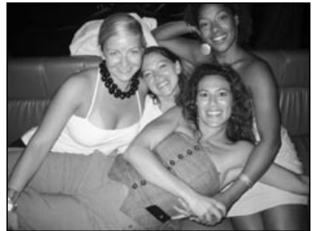
Having Fun at an On Tap Event!

Having a party or a fundraiser? Have it at Bullfeathers. Bullfeathers can accommodate anywhere from 50 to 250 people. Because of their proximity to the Hill, Bullfeathers is popular with members of Congress and their staffs. It's easier for them to make events at Bullfeathers and still get back for votes. Besides, the food and atmosphere is great. Try the party that offers ten appetizers and an open bar for three hours at a cost of only $35.00 per person. It's the best deal on the Hill. They also cater breakfast meetings for $13.95 a person. These are great for fundraising. Less than a block from Capitol South Metro Station, Bullfeathers is easily accessible from all over the city. It's a great place to meet for a drink, lunch or dinner. Friendly politics abound at Bullfeathers. Please visit www.bullfeatherscapitolhill.com or call, Stratton, Mike or Jimmy Liapis at 202-543-5005. They will be glad to help with all your catering needs. E-mail us at Bull5005@aol.com . Bullfeathers is located at 410 First Street SE.