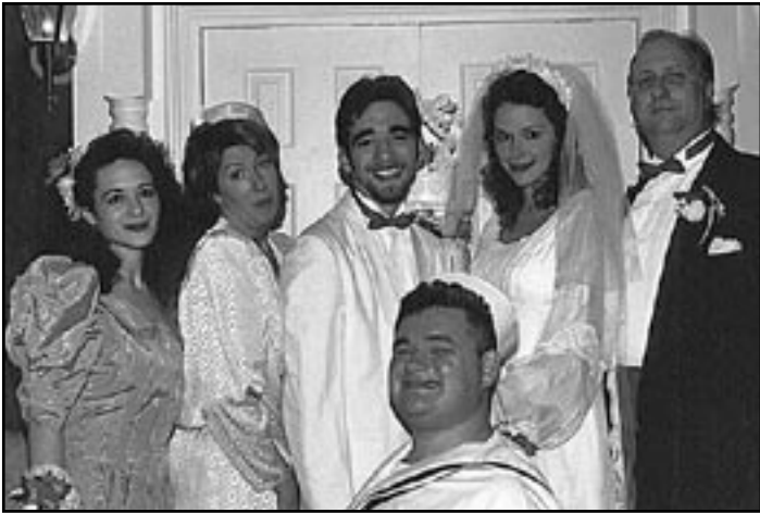
The Cast of Mystery Dinner Playhouse

parties, fundraising events, and even small group gatherings. The room rental fee is $100. This reserves the room solely for you and your guests. The upstairs room features a three-sided open stone fireplace for fireside dining. A full bar is available which provides a selection of 14 draft beers, premium and house liquors, and an assortment of house and premium wines. A stage is located at the front of the room, which can be used for presentations or entertainment. Flowers or balloons are available upon request. The upstairs room is available for private parties Sunday through Thursday during operating hours. On Friday and Saturday nights, special arrangements are required. Their chef has designed a number of menus to accommodate your dining needs. A pre-order (minimum of four days) is required to ensure the kitchen staff has plenty of time to order and prepare your menu selections. Any one of the management staff will be more than happy to answer any questions regarding your special event. Murphy's looks forward to making your event memorable and fun. Murphy's is located in the heart of Old Town Alexandria, at 713 King Street. Call 703-548-1717 for more information or visit their website, www.murphyspub.com