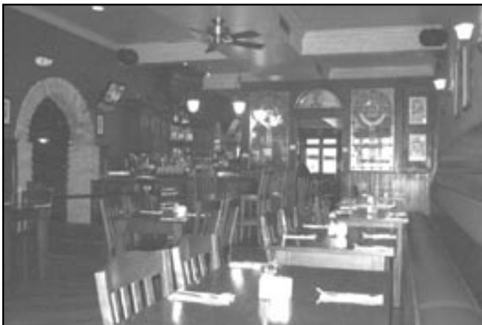
Ireland's Four Courts