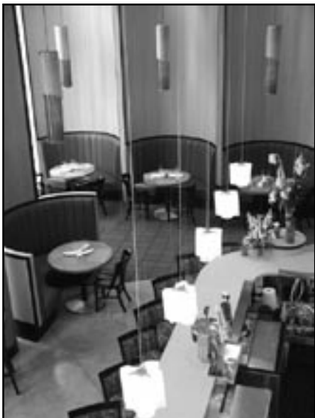
Beacon Bar & Grill