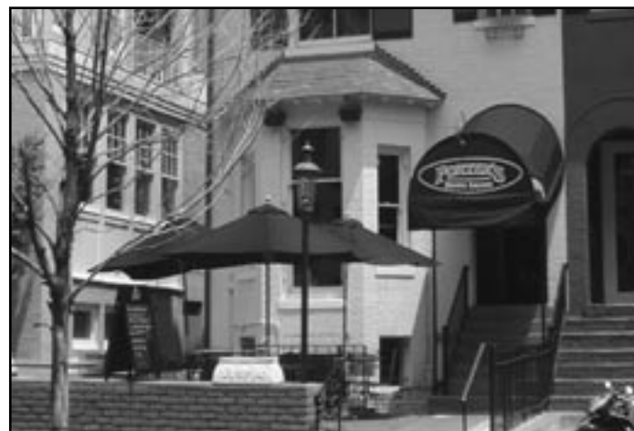
Porter's Dining Saloon

Ready to try somewhere new but want to make sure your event is a success? Porter's may be new to DC but the staff here are pros, and the friendly atmosphere has you feeling like a regular on your first visit. Three floors and three separate bars are just a few of the things that make holding an event at Porter's easy and fun. Each floor varies slightly. The upstairs level is a more formal or lounge style setting, the main floor is a classic brick and brass pub and the lower level is party central with a dance floor. Porter's offers a full menu featuring Classic American Cuisine with creative touches. Twelve plasma TVs across the three floors make Porter's the perfect place for an alumni or sports fan gathering, but the super convenient mid-town location means happy hours here are a breeze. Porter's serves lunch and dinner daily and offers nightly specials and events. In addition to hosting events, Porter's offers catering services, great for those lunchtime meetings! Located at the corner of 19th and M Streets in NW DC, the address is 1207 19th St. For more information, please call 202-775-3797 or visit them online at www.portersdc.com .