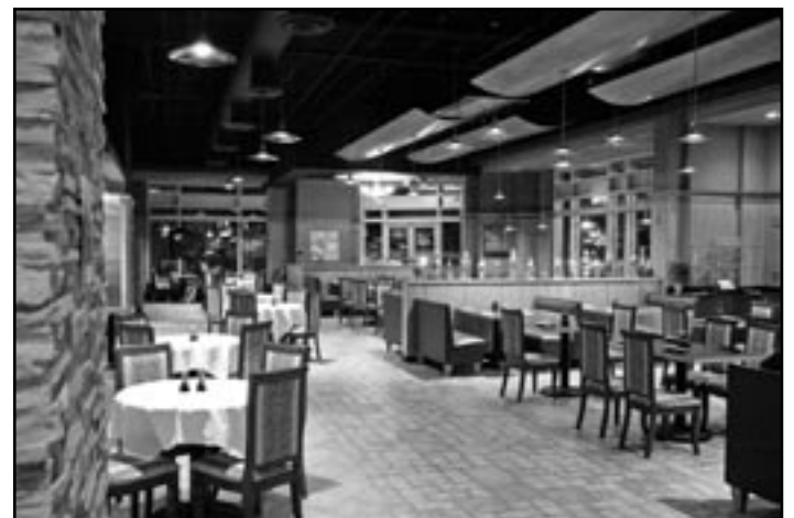
Eurosia Fusion Restaurant

Eurosia's modern, Zen atmosphere and East-West fusion cuisine create the perfect scene for a party. Stylish young professionals head to Eurosia for it's warm environment and amazing dishes. The spacious and chic bar area is ideal for those looking to have a relaxed evening and the elegant dining area provides an upscale setting for all tastes. With a separate VIP lounge, a modern island bar, six plasma TVs, a large patio seating for up to 80, Eurosia can host parties and banquets for all occasions. And for those looking to experience this creative fusion cuisine in their own setting, catering is available. Chef Munehiro Mori, Executive Chef and Managing Partner of Eurosia, has built his name and reputation on the development of East-West fusion cuisine. A full sushi bar on site provides new age sushi as well as classic combinations that are swimmingly fresh. The affordable menu is full of unique European and Asian fusion cuisines not comparable to any creation or style in this area. The atmosphere is upscale yet the prices are reasonable and there is no rental fee for private rooms. Be sure to compliment any dish with Eurosia's extensive Sake selection. Call 703-668-9383 for your next event, big or small, or grab your friends to enjoy a refreshing cocktail menu and a variety of appetizers after work. Check their website for special events and a listing of live music, www.eurosiafusion.com . Eurosia is located in the heart of Reston, at 11730 Plaza America Drive.