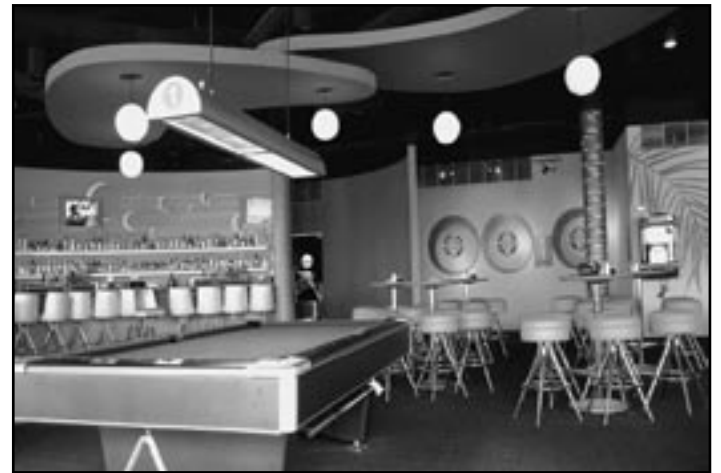
Continental Modern Pool Lounge

Continental, a modern pool lounge, features interior design elements inspired by nightclubs from the '50s, '60s and '70s. The jet-set décor includes nine pool tables, over 80 spaghetti lights, patterned columns painted like palm trees, giant Tiki heads and two long, curving bars that sparkle with glitter. Several lounge areas with various themes include a Space-Age Bar, a Jet-Set Dining Room, the Op Art Billiard Room and the Exotica Bar & Lounges. Featured in "What's Cool" in the Washingtonian and described as "Quite a Trip" by the Washington Post, Continental is unlike any place in the Washington area. Continental is available for private parties, from intimate gatherings of 10 guests to large events for up to 275 people. It's a fun and exciting place for office parties, happy hour gatherings, birthday celebrations, and bachelor and bachelorette parties. Located in Rosslyn at the corner of North Moore and Lee Highway in Arlington, VA. For more information please contact our Event Manager Jonathan Maxson at 202-337-5550 or visit us on the web at www.modernpoolounge.com . Continental has free parking above the space after 5pm.