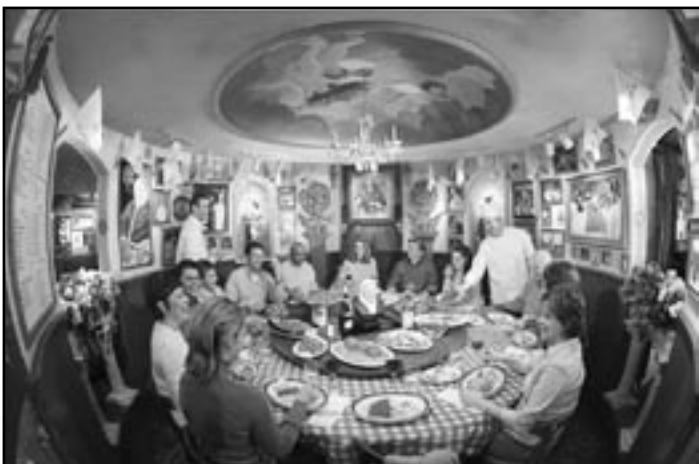
Buca di Beppo

The Beacon Bar & Grill offers four distinctive ambient experiences under one roof, and caters to the varying lifestyles of its patrons. BB&G incorporates a high-energy, hob-knob lounge area with a two-story atrium room showcasing the bustling Dupont Circle neighborhood, plus a casual outdoor café. As an event or “party” venue there are three private rooms capable of handling as many as 120 people. Secluded nooks and separate booths offer a distinct setting for business or intimate dining in what has been described as a dining room reminiscent of an ocean liner. The most sought-after venue for private parties is the Rooftop Penthouse, where the city serves as the background and a fountain adds to the festive feel. The Beacon Bar & Grill’s expert culinary team will work with your personal preferences and utilize the talents of the kitchen to customize a unique event for you. BB&G’s impressive menu will present American and globally inspired dishes that are visually stimulating and a treat to the palate. Menus for the holiday season are available for your review. Individual reservations can be made directly via our website www.bbawdc.com or www.opentable.com or for private dining or banquets call our catering department 202-296-2100 or 202-872-1126. Beacon Bar & Grill is located at 1615 Rhode Island Avenue, NW.