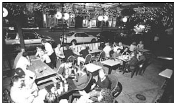
Adams Mill Bar & Grill

For a great party with a relaxed and carefree atmosphere search no further than Adams Mill Bar & Grill in the heart of Adams Morgan. The festive location right at the corner of Columbia Road and 18th Street makes Adams Mill a convenient location to hold your party inside and outside on our beautiful covered patio. Our third floor is available for private parties while the second floor is perfect for sports themed parties. Our classic saloon style bar and patio features a long oak bar surrounding the restaurant. The facility is available for rental any night of the week and rental costs vary with size of party and individual needs. Open food costs usually run $4-$5 per person for two hours and open bar costs about $15-$20 per person for two hours. Adams Mill features a Sunday Crab Feast every week, plus Monday Night Football specials including $0.25 wings and $2 Miller Lites, with Party Platters available. Adams Mill Bar & Grill is located at 1813 Adams Mill Rd. in Adams Morgan. For more information call Darrell at 202-332-9577.