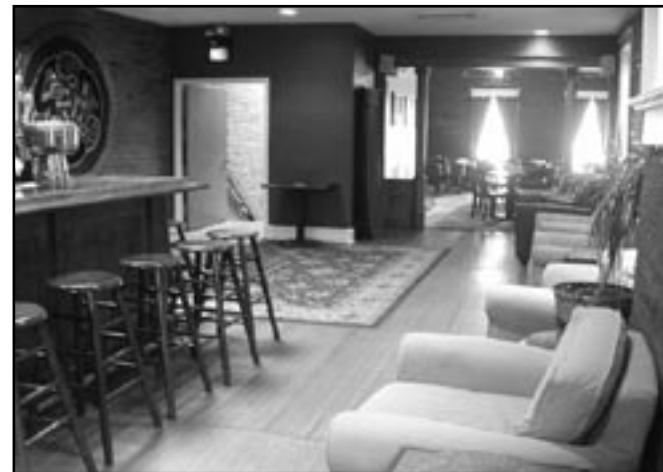
Finn mac Cool's

Located along historic Barracks Row on Capitol Hill, Finn mac Cool's Irish Publick House offers a comfortably appointed private second floor for everything from birthday parties and anniversaries, to business meetings and awards dinners, or simple happy hours with friends. Our upstairs room includes dinner seating for up to 50 people, a full bar, and standing room for a cocktail party of up to 150 people. Our exposed brick walls, cherry bar, and soft lighting create a satisfying yet neutral canvas appropriate to any occasion. For larger gatherings, the entire pub may be reserved. Finn mac Cool's offers a range of traditional, yet imaginative Irish pub grub, as well as American bar favorites, and 10 draft beers. Join us weeknights for Happy Hour and enjoy $4 premium pints, $2.50 domestic pints, $2.50 rail drinks, and our complimentary buffet. Join us Sunday nights for $12 ribs and $2.50 Yuengling and Miller Lite pints, and Monday nights for 1/2 price Burgers and $4 Pilsner Urquell pints. Thursday nights enjoy 25 cents Wings and $2.50 Miller Lite pints. Finn mac Cool's is walking distance from the Metro, just two and a half blocks south of Eastern Market station at 713 8th Street SE. For more information call 202.547.7100 or go to www.finnmaccoolsdc.com .