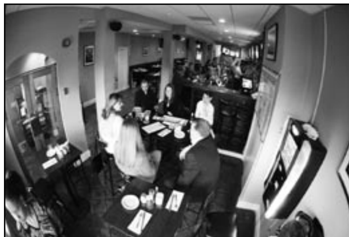
The Ugly Mug

Thinking about throwing a party? The Ugly Mug is the perfect place celebrate any event! We will work with you and your wallet to make sure you have a fantastic party. Birthday parties, holiday happy hours and all other events are perfect at The Ugly Mug. We look forward to working with you to make your event a success. We have a private room available for private parties of 30 or less. Table reservations are available for more intimate gatherings, or you can make special arrangements to rent the entire bar! With its casual atmosphere, great food and 24 beers on tap, The Ugly Mug is just the place to relax and unwind. You can do it all... watch your favorite sporting event, visit with old friends and meet new ones. The Ugly Mug is where to come on Capitol Hill to have a good time! Open daily for lunch and dinner, The Ugly Mug serves top-quality classic American favorites like Mini Cheeseburgers and Brick Oven Pizzas. Other specialty dishes including the Filet BLT and Country Fried Steak are also on the menu. Private parties of all kinds, small or large are welcome. The Ugly Mug is conveniently located two blocks from the Eastern Market Metro station at 723 8th Street, SE. Please visit www.uglymugdc.com or call 202-547-UGLY to book your next event.