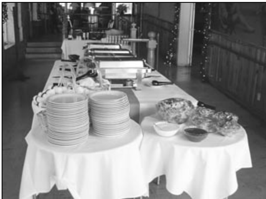
Whitlow's on Wilson

Siné, Gaelic for "this is it," boasts architecture, furniture and décor straight from the Emerald Isle. A full service bar and professional wait staff makes Siné the perfect setting for business lunches and after-work or family gatherings.