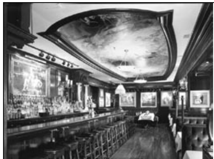
Old Ebbitt Grill

A Washington Tradition, odds are you have already been to an event held here. Just a short walk from the White House, Old Ebbitt's historic Cabinet Room accommodates up to 50. The Atrium holds up to 400 in contemporary style with marble fountains and floors. Other party spots include their famous Oyster Bar and Rooftop Deck. Total capacity will vary according to the type of party you are holding. Your options include cocktail parties, seated dinners and dinners with a dance floor. Old Ebbitt serves classic American saloon food, and is known for their Oysters. Food can be served as hors d'oeuvres, buffet style or as a full seated dinner. The bar is fully stocked, and a professional wait staff is on hand to serve you. The cost for rental and food will vary with the party. Perhaps the biggest draw to the Old Ebbitt? Rooftop panoramic views of the Mall and White House, and a tremendous downtown location. The Old Ebbitt is available every night except Christmas. For reservations and party planning, please contact Jaki Downs, Private Party Manager at 202-347-4800. The restaurant is located at 675 15th Street, NW in Washington. You may also visit their web site at www.ebbitt.com , or email them at parties@ebbitt.com .