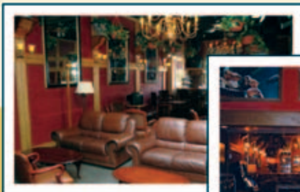
Conveniently located near Capitol South and Eastern Market metro stops.

319 Pennsylvania Ave., SE 202-546-7782 www.TopOfTheHill-dc.com